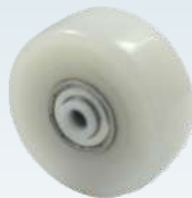
ELN -31° to 248°F 95A +/-3 Nylon