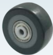
PU -40° to 194°F 95A +/-3 Polyurethane