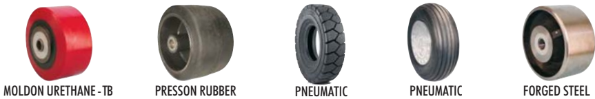
MOLDON URETHANE -TB