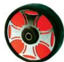
RollX™ - Maltese Cross Red

** Swivel caster comes standard with UWB