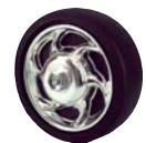
RollX™ - WOW - RB