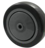
IP-PB-TG -40° to 190°F 55A +/-3