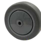
IR-PB-TG -40° to 185°F 75A +/-3