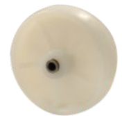
NY -31° to 248°F 75D +/-3