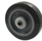
IP -40° to 190°F 55A +/-3