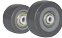
PU-PB -40° to 194°F 95A +/-3