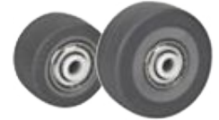
TPE-PB -40 to 180F 75A +/-3