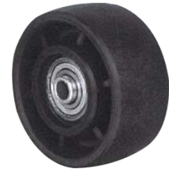
GFN -30° to 212°F 85D +/-5 Glass Filled Nylon