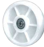
NYHD -30° to 248°F 75D +/-3