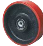
UR -40° to 194°F 95A +/-3