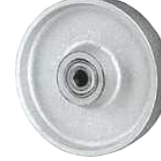
SSC -44° to 180°F (Standard) Consult CWBC for temperatures to 800°F 95-98 Shore D