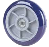
PLY -40° to 194°F 95A +/-3