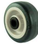
MPUG -30° to 180°F 95A +/-5