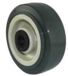
EZ -50° to 180°F 65A +/-5