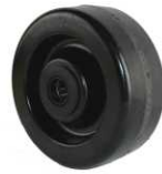
PH -50° to 250°F 102 Rockwell E