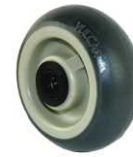
EZC -50° to 180°F 65A +/-5