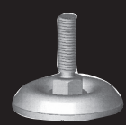
Metric Stem HN